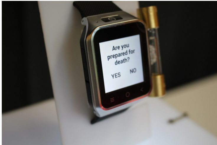
Figure 2 The SOULAJE Prototype

The Soulaje DF 4 , a self-administered euthanasia wearable was designed as a response to the workshop co-designers expressed desire for self-control in their lives in relation to living and dying with dignity. It was conceived as an indirect response to participant perception and the feeling that the ageing in place policy removed control from older people and viewed them as a burden on society. Soulaje aimed to further open the debate around the societal, ethical and legal aspects of technology-enabled assisted dying. The Soulaje DF comprised two documents, namely a quick start guide for the Soulaje and an anti-euthanasia campaign flyer, a prototype of the euthanasia wearable and a short video clip advert of the Soulaje ‘product’. Set after the year 2021 the Soulaje DF provides a medical product for self-administered euthanasia. According to the DF the Soulaje product is developed and distributed by a third party business, which has been sub-contracted by a central healthcare service, and is available to people over a specific age in consultation with a GP. A number of safeguards are built into the wearable to avoid misuse, as described in the quick start guide. Worn on the wrist, like a watch, the Soulaje device comprised a capsule containing a lethal drug and a drug delivery mechanism controlled by a touchscreen interface (see Figure 2).