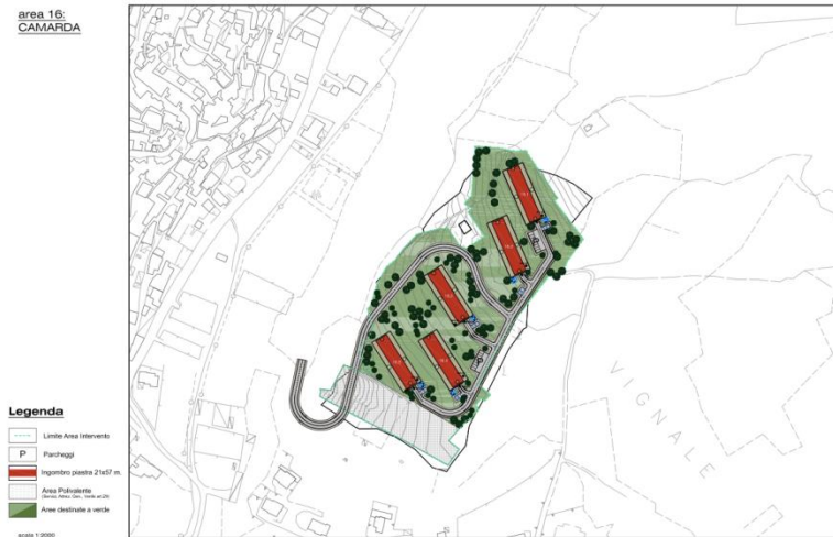
Pic.4 A representation of the Camarda C.A.S.E. project

It is interesting to notice that, as a part of the new development, a small parcel (at the bottom in Pic. 4) called “polivalente” (multi-purpose) was provided for leisure activities, where inhabitants had to share outdoor public life. The Italian Civil Defence provided not just the infrastructure but also furniture; a semi-permanent large tent where birthdays, marriages and meetings are celebrated. Close to this large tent, an allotment has also been organised. This space for growing plants is explicitly referred to as an “Urban Garden” as shown in picture 6.