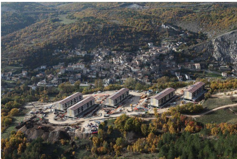
Pic.3 The new C.A.S.E. site (at the front) and the old town (behind)

After the quake five blocks of flats were built in this area. In this way the Government made an infrastructural transformation and also changed the function from agricultural to urbanised land.