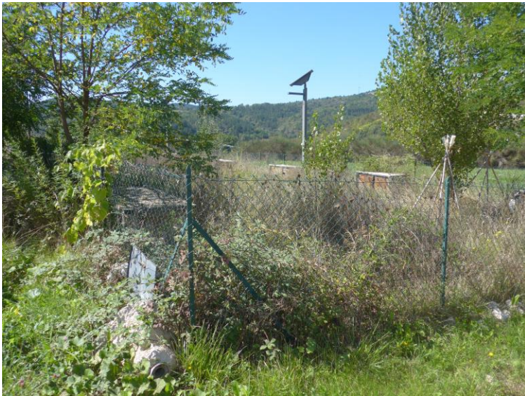
Pic. 7: September 2016

In 2014 the Garden was almost abandoned, and as a result the L'Aquila city council closed the public water faucet in 2015. Picture 7 shows the condition of the garden today.