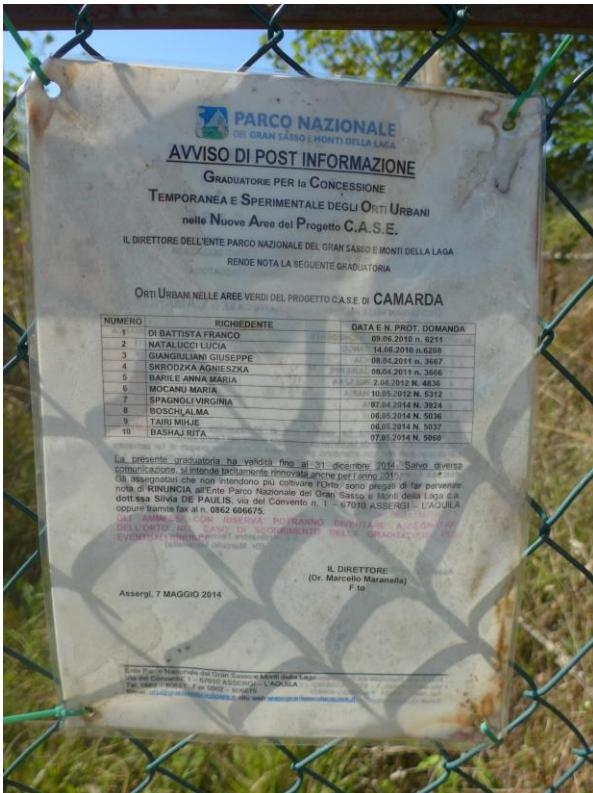
Fig. 6: Information plaque with the names of people authorised to use the allotment in 2014. The allotment is explicitly referred to as “Orto Urbano” (Urban Garden).

The “Ente Parco” (the institution that manages the protected area of the Gran Sasso National Park) prepared this allotment mainly because of the number of old people forced to leave their damaged houses and move to the new flats. The general idea was to give a sense of continuity to their previous lives. In the quake’s aftermath many inhabitants tried to stay close to their uninhabitable homes so that they could maintain and feed their vegetable garden and animals. The planners viewed the urban garden as fundamental to preserve this practice. However the garden was not used in the anticipated manner. As noted, the newly introduced urban garden was installed in a farming area where cultivation already existed, with many implicit rules and meanings of garden and gardening. In particular, the vegetable garden as a private and personal, rather than a shared, daily task was central. Gardens provide an exclusive source of food for individuals or families (which could be also redistributed in a second moment) and they are not cultivated in common.