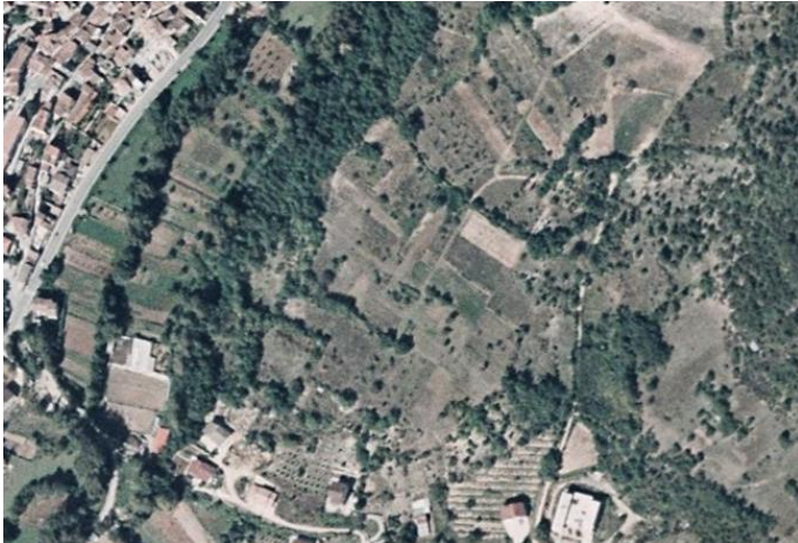
Pic.2: Aerial photograph of cultivated lots on the periphery of Camarda

Immediately after the quake, the Camarda rural area, where the C.A.S.E. blocks (Anti Earthquake Sustainable and Ecological Housing Scheme) were built, was possessed by the State under emergency regulations. In picture 2 it is possible to observe that, before the possession, the area was cultivated and fragmented in many lots, mainly for farming. It is commonplace in this mountainous region of the Apennines to find agricultural areas spatially close to historic centres with access to fresh water.