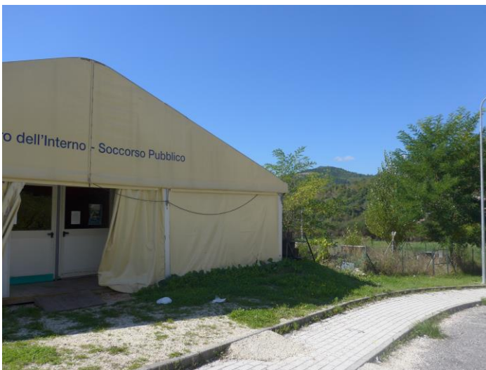
Pic. 5: On the left side the large tent and to the right side the garden

It is interesting to notice that, as a part of the new development, a small parcel (at the bottom in Pic. 4) called “polivalente” (multi-purpose) was provided for leisure activities, where inhabitants had to share outdoor public life. The Italian Civil Defence provided not just the infrastructure but also furniture; a semi-permanent large tent where birthdays, marriages and meetings are celebrated. Close to this large tent, an allotment has also been organised. This space for growing plants is explicitly referred to as an “Urban Garden” as shown in picture 6.