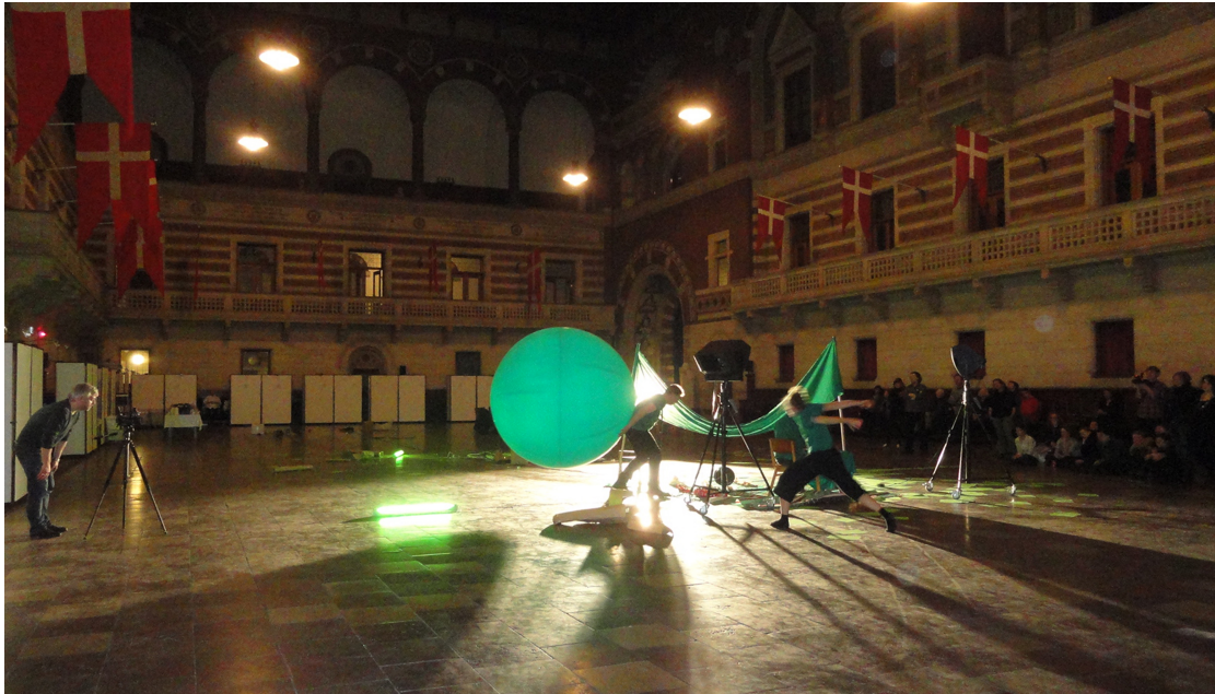
Copenhagen City Hall, Feb. 29th, 2012