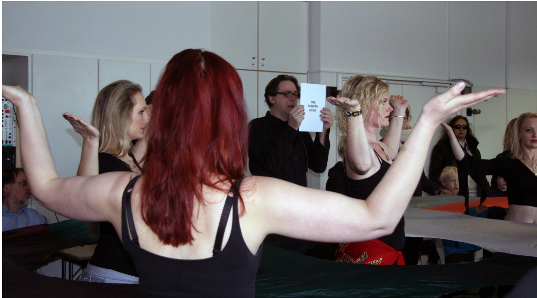
Kulturhuset Islands Brygge, Copenhagen, January 15 th , 2012