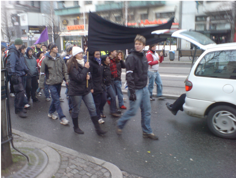
Gothenburg, November 23rd 2006