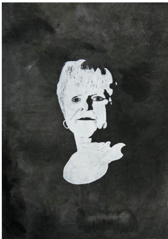
September 2001 The Father House ink and acrylic on paper 53x76cm 2008