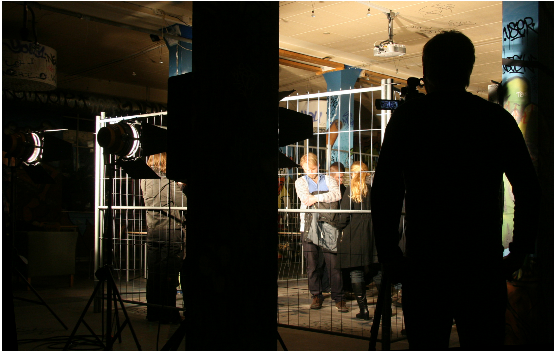
Det Fri Gymnasium, Copenhagen 6.3.2012