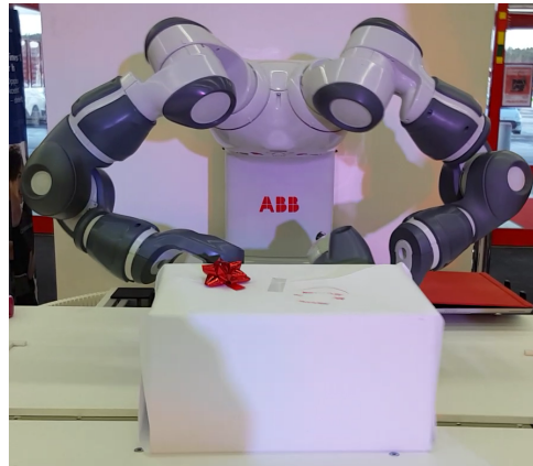
Fig. 1. The gift-wrapping setup.

arm could be utilized to achieve unusual, but effective joint configurations. In the following, we will describe the circumstances for the application, including the gift-wrapping process as such, and then discuss our experiences from the programming process. Here, we will point out open issues that we identified regarding the usability and support of the programming tools for the dual-arm and 2x7 degrees of freedom properties of the robot, focusing on the physical, lead-through supported kinesthetic teaching.