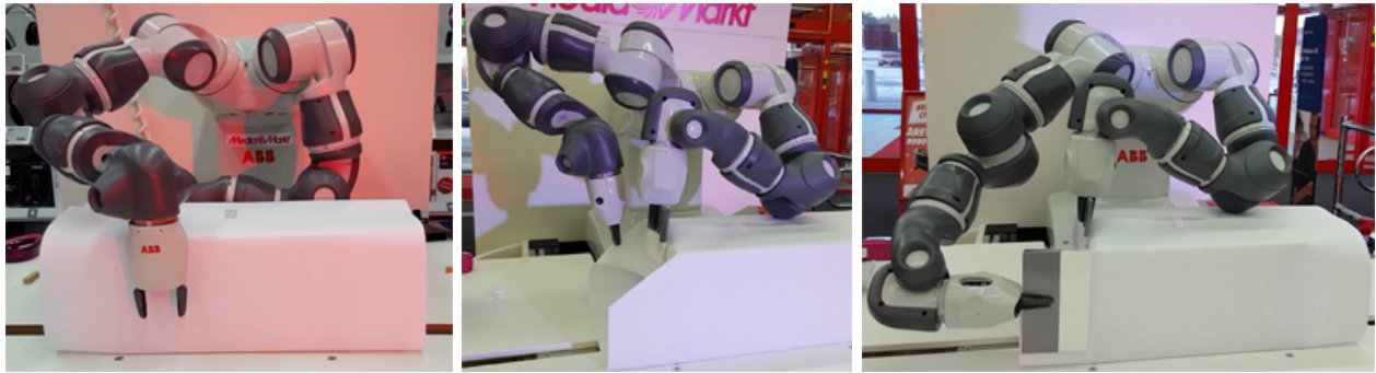
Fig. 3. L: The box is rotated using the side of the grippers and one of the arms as a fixture; C: The paper corners are folded using the fingers; R: The robot uses pieces of cardboard to fold and straighten the paper around the corners of the box.