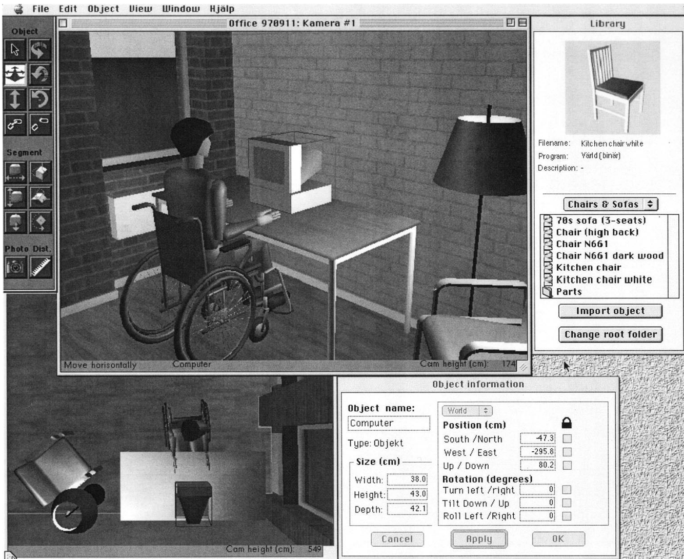
Fig. 1. The interface of the prototype. Two windows show the world viewed through two different cameras. A selected object (in this case, the computer on the table) is indicated with a red bounding box. To the upper left, the toolbar contains buttons for selecting, moving, rotating, linking, and un-linking objects; moving and rotating segments; measuring distances; and taking photos. Below to the right, the “Object Information” window supports editing of an object’s name, size, position, rotation, degrees-of-freedom, etc. To the upper right, the “Library” window supports browsing for, and importing new objects into the world. The window shows a preview image and text information of an object (if present), and a file/folder browser.