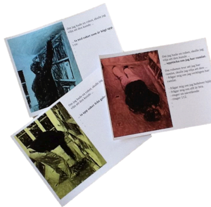
Figure 3. Sample attention cards

So far, the first focus groups, workshops, questionnaires and interviews have been carried out. One particular problem we observed during the focus groups was that the seniors tended to think that being monitored and having a robot would be a good idea for others but not themselves. To address this, a new method was initiated, created and developed: attention cards . The attention cards were designed to visualise day-to-day situations/scenarios in seniors' everyday life. These situations/scenarios had been identified during the focus groups. First person narrative scenarios were used to describe how the robot might meet the seniors' needs in these situations. For example, a photo illustrated someone lying face down on the floor and the text on the card presented alternative actions such as: Ask if I need help, Call a relative, Call 112. There was an empty space for the participants to fill in other actions they would like the robot to take (Figure 3).