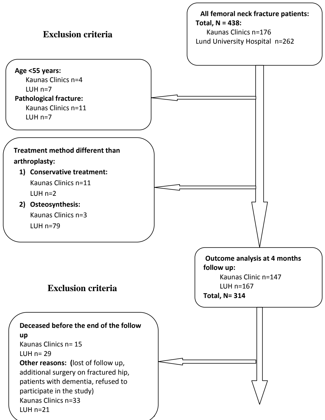
Figure 1. Flowchart of all femoral neck fracture patients treated in both institutions.