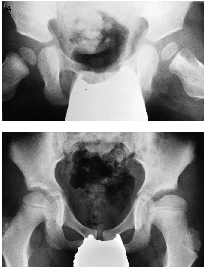
Figure 2 (case 10).