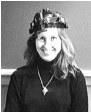
Figure 1. The SMI iView headset.