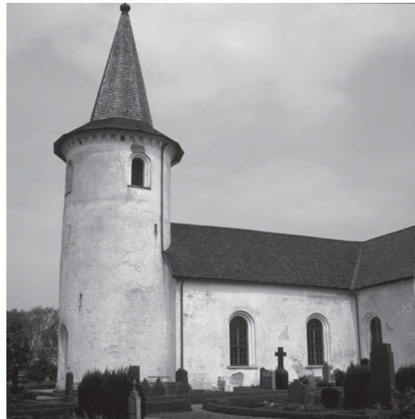
Fig. 3. The church of Bollerup, Scania in Sweden. Photo: J. Wienberg, May 1984.

as the polygon tower in Lärbro on Gotland and Assens on Funen.