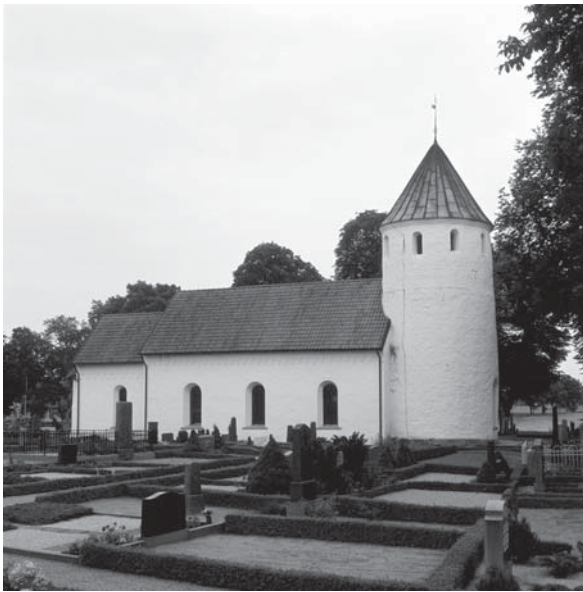
Fig. 2. The church of Hammarlunda, Scania in Sweden. Photo: J. Wienberg, July 1980.