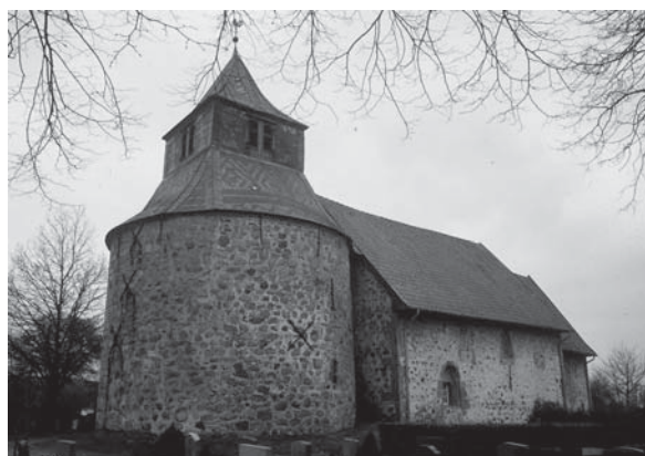
Fig. 4. The church of Översee, Southern Schleswig in Germany. Photo: J. Wienberg, April 1979.

Many, all too many medieval churches in Scandinavia have been interpreted as defensive churches. In this way all round churches in Scandinavia have been interpreted as fortified in an influential dissertation by