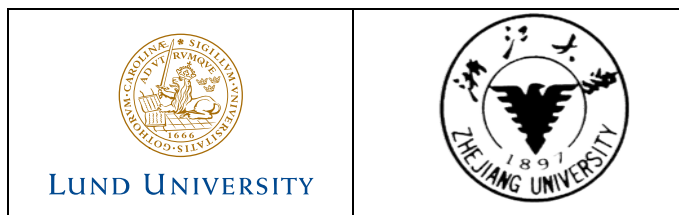
Figure 3. Lund University's and Zhejiang University's logotypes.

Lund University (LU) was founded in 1666. The ultimate goals for Lund University in Sweden, as of most universities in Sweden and around the world, are to perform research, to assure education and to interact with the society outside university. Two of the university's top four (4) strategic goals are internationalization and cross-disciplinary teaching. LU consists of 9 faculties with a total of approximately 39 000 students. The Faculty of Engineering (LTH) and the School of Economy and Management (LUSEM) are two of its largest faculties with about 5000 students each.