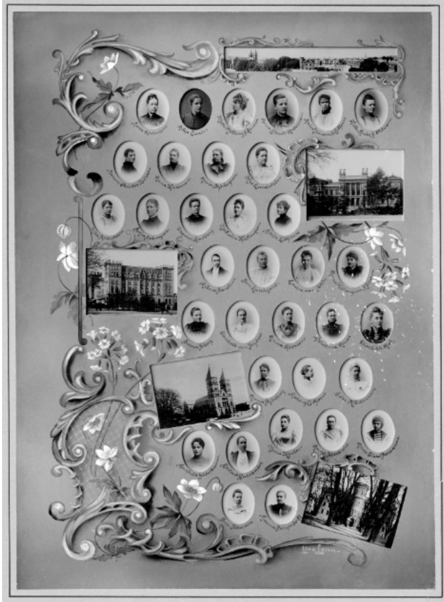
Figure 7 Fotocollage from eth 1890s of most (but not all) of the female students at Lund University up until that time; made by Lina John, a pioneering female photographer

This chapter builds, in part, on a yet unpublished manuscript that is part of a larger sumnerical popular historical work on Lund University scheduled for release in December 2016.