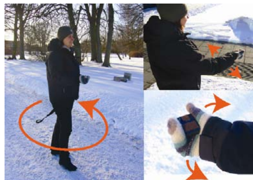
Figure 6. a) Whole body rotation keeping the arm and hand fixed relative to the body, b) arm scan, c) wrist flex

We saw three main types of standing still gestures. The first, which basically all users made use of, was to hold the device out in front of the body, keeping the arm and hand position fixed relative to the body, and walk around on the spot (sometimes in a small circle), see figure 6a. A gesture which was used both while walking and while standing still was the arm scan. In this gesture the arm was moved to the side and back again, see figure 6b. This gesture occurred to one side only or from side to side. The third type was hand movement only – the user moved the hand by flexing the wrist (figure 6c). This gesture was also used both standing still and while walking.