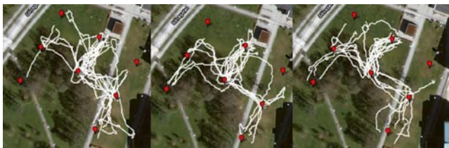
Figure 3. Trails for 10 ° (left), 30 ° (center) and 60 ° (right)

Trails at the main (more realistic) test location can be seen in the following sequence of images.