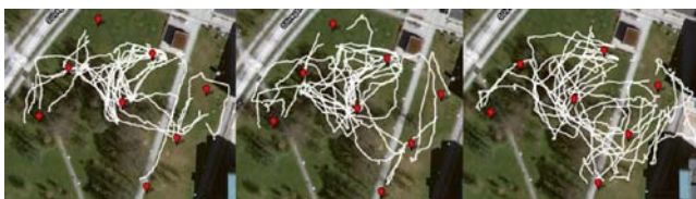
Figure 4. Trails for 90 ° (left), 120 ° (center) and 150 ° (right)