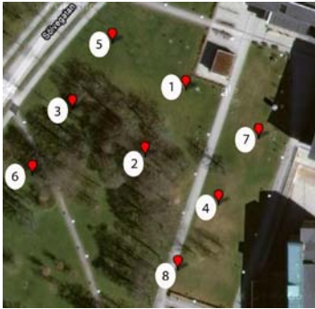
Figure 1. The grid points for the test trails. All trails started at 1. At 2 you could turn either right or left. The same happened at the following point (3 or 4). The four possible goals were located at 5,6,7 and 8. Picture made with GPSVisualizer, http://www.gpsvisualizer.com/ .

To see what happens in a completely open environment we also carried out three tests in an open field further away. The test tracks were based on a grid structure (see figure 1).