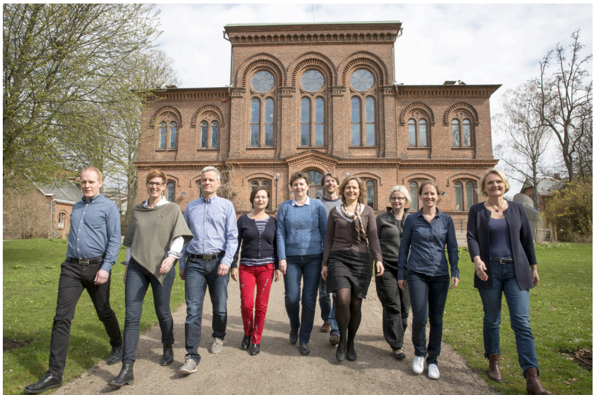
eHealth core group at the Pufendorf Institute. (Tomas Kirkborn not in photo)

In our final contribution eHealth and the digital reinvention of healthcare Martin Stridh discusses how the healthcare system can adapt to and make use of the momentum of the health initiatives in the private sector. He looks in particular at the importance of a planned integration of the private health market into the healthcare system.