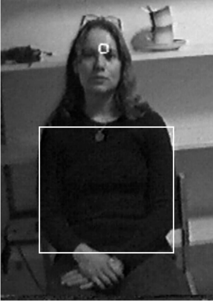
Figure 1. The speaker's central gesture space as a rectangle. Everything outside the rectangle represents the speaker's peripheral gesture space. The addressee's fixation as a white circle at its default location in interaction.