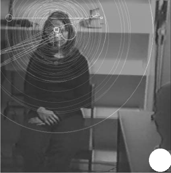
Figure 4. The saccades, fixation locations, and fixation durations of an addressee looking at a speaker. The diameter of the circles indicates the duration of the fixation. The fixation comparison point in the bottom right corner equals one second.