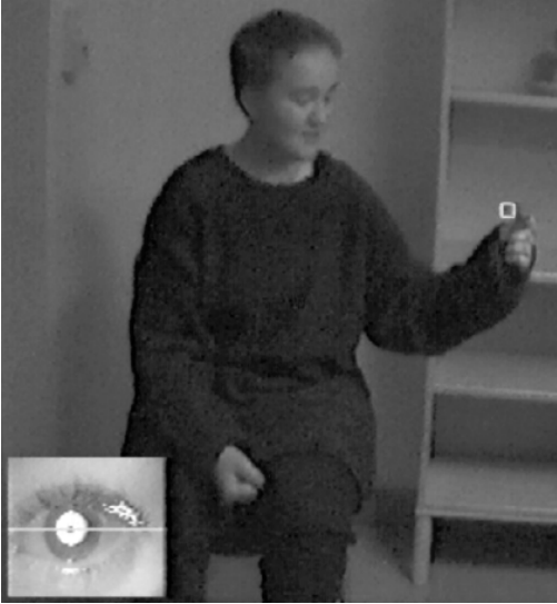
Figure. 2. Example of a speaker-fixated gesture that is also fixated by the addressee (=white circle). The addressee's eye is shown as a picture-in-picture.