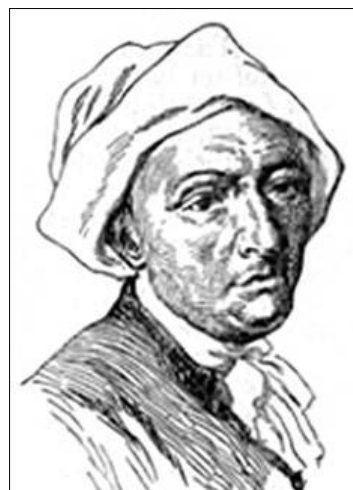
Figure 2: An engraving of de la Hire made during his lifetime.

The circle with 179 numbered slots on the middle disk is arranged as follows: