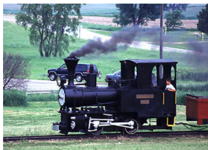
Steam Locomotive Hibernia AG No. 7

In the case of outdated technologies as the steam locomotive; the problem deserves a deeper analysis because there is nothing wrong with their noematic and their pragmatic aspects. These levels work “properly” notwithstanding that these technologies, are useless . Time- or historical-brokenness cannot be explained in terms of noematic and pragmatic aspects nor with reference to their onticality or ontologicity.