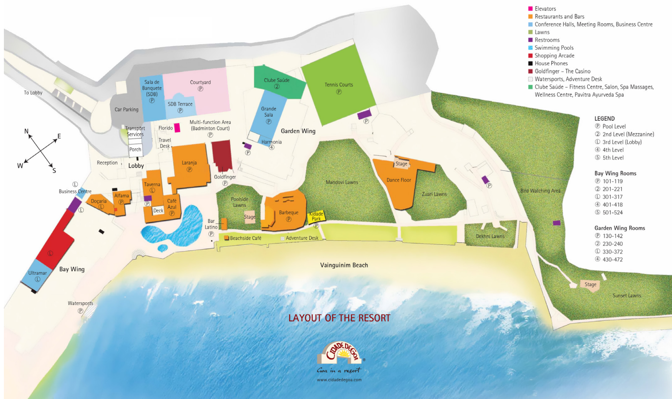
Map 1: Meeting venue - Cidade de Goa ( http://www.pages-osm.org/osm/location/venue )

PAGES 4 th OSM is held at Cidade de Goa Beach Resort, Dona Paula, Goa (see map). The inaugural session and all plenary sections is held at Grande Sala . The parallel oral sessions are at Grande Sala and Sala de Banquete . Breakout sessions and group meeting can be held at Harmonia , if booked with the conference office in advance. Poster sessions are held at Mandovi lawns and Zuari lawns .