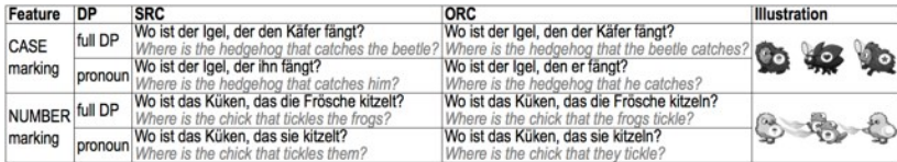
Figure 1: Test sentences in the referent-identification task by RC type (SRC/ORC), embedded DP type (full DP/pronoun) and feature type (case/number).

Accuracy of referent-identification revealed that SRC>ORC ( p<.001 ), pronoun>full DP ( p=.003 ) and case>number ( p<.001 ), see the results in Figure 2. While preschoolers performed better with ORC disambiguated by case marking than if they were number-marked ( p=.003 ), the morphological cue did not modulate school children’s ability to correctly interpret RCs. Moreover, an embedded pronoun aided comprehension if disambiguation was driven by number, but no such effect arose with case ( p=.05 ).