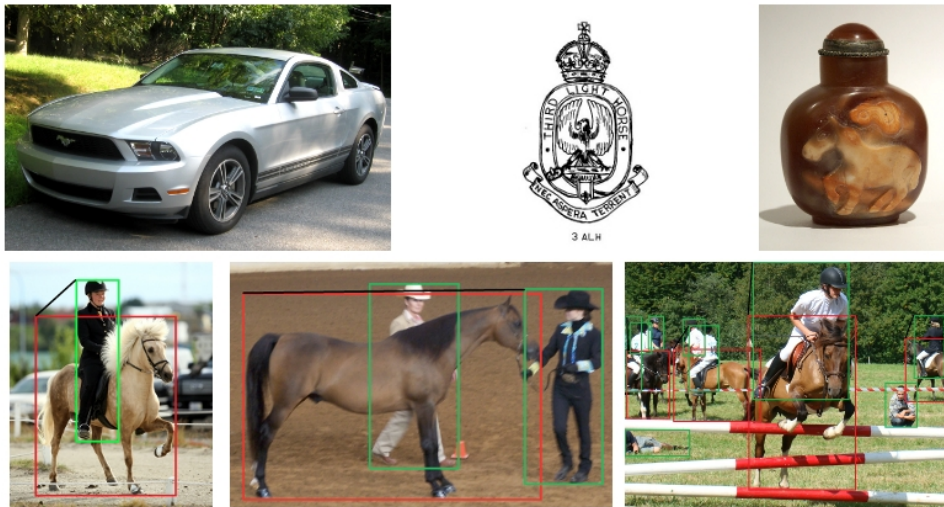
Figure 1: The upper row shows: A Ford Mustang, the 3rd Light Horse Regiment hat badge, and a snuff bottle. The lower row shows: A human riding a horse, one human leading the horse and one bystander, and seven riders and two bystanders. Bounding boxes are displayed.

solver (Stamborg et al., 2012) to parse the Wikipedia articles. For each word, the parser outputs its lemma and part of speech (POS). In addition, the parser produces a dependency graph with labeled edges for each sentence as well as the predicates it contains and their arguments. For each article, we also identify the words or phrases that refer to a same entity i.e. words or phrases that are coreferent.