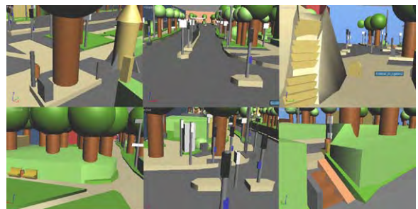
Figure 1. Views from the traffic environment model used.

[3]: moving the world using the arrow keys, moving the world by pushing the sides of the limiting box with the PHANToM stylus and moving the world by clicking & dragging using the PHANToM stylus.