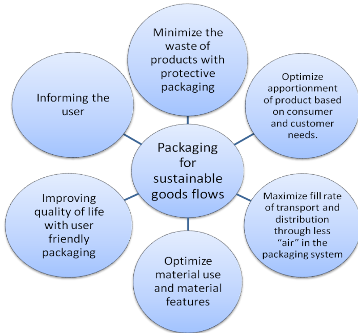
Figure 2. Framework for sustainable goods flows from a packaging perspective.

From our case survey analysis quite many observations and examples are found where a packaging perspective on the flow of goods show great potentials in improving sustainability performance i.e. improving financial, environmental and social aspects. In Figure 4 the main insights found are presented as a framework of dimensions for sustainable goods flows from a packaging perspective. These dimensions will be elaborated in the following text and put in relation to other published work.