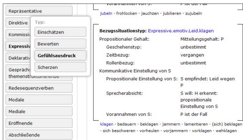
Fig. 6: Situation referred to by klagen (‘complain’) and its synonyms.

None of the verbs which are part of the field represented in Figures 2-5 share any special contextual restrictions on the basis of which they may be claimed to be even closer synonyms. Synonymy relations of this kind may be observed from a comparison of the contextual restrictions associated with the use of the verbs klagen (‘complain’), jammern (‘moan’) and lamentieren (‘lament’). These verbs are used to refer to situations in which a speaker who feels sorrow because of something (P: a past action, event or state of affairs) makes one or more utterances with the intention that the hearer recognize that he/she, i.e. the speaker, feels sorrow because of P. The situation referred to by klagen and its synonyms is represented by the screenshot in Figure 6: