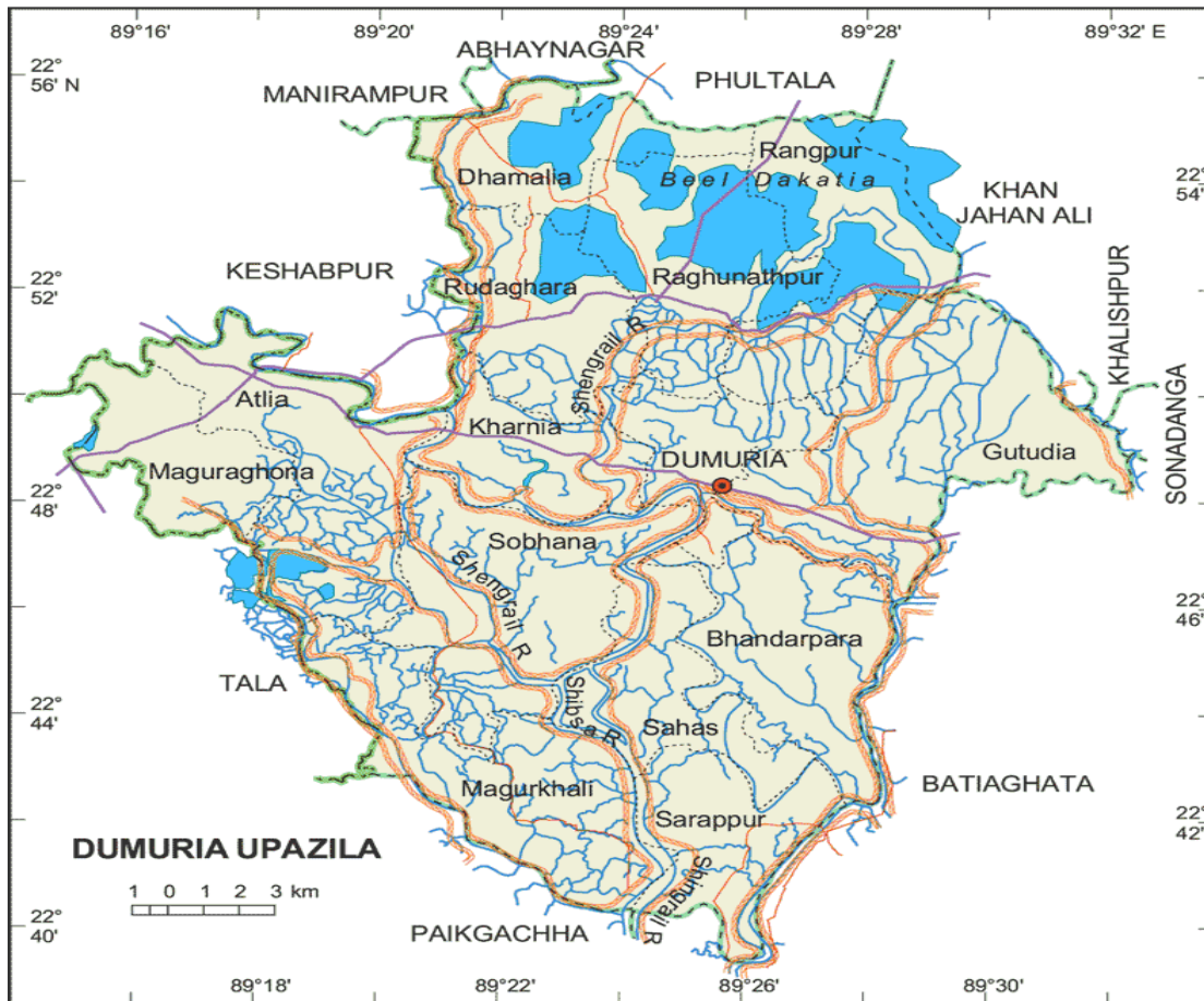
Fig. 1. Geo map of Dumuria Upazila of Khulna District in Bangladesh (Study area)

Polder 29 were Tk 71,401.00 and 52,172.00, respectively and the per hectare gross return of Boro Paddy inside Polder 29 was Tk 85,800.00. Per hectare net return of T. Aman and Boro paddy inside Polder 29 was Tk 22,396.00 and 30,463.00 respectively, whereas per hectare net return for T. Aman paddy outside Polder 29 was Tk 3,254.00 which was much lower than the net return inside Polder 29. The reason of this variation is the salinity problem in Latabunia. T. Aman production was very low in Latabunia due to higher salinity which is caused by Cyclone Aila (2009). Per hectare gross margin for T. Aman and Boro Paddy inside Polder 29 were estimated at Tk 57,626.00 and 67,341.00, respectively while per hectare gross margin for T. Aman paddy in Latabunia was Tk 38,362.00 only. Undiscounted BCR for T. Aman Paddy inside and outside Polder 29 were 1.46 and 1.10, respectively on total cost basis. Again, for Boro paddy BCR was 1.60 on total cost basis (Tables 1, 2 and 3).