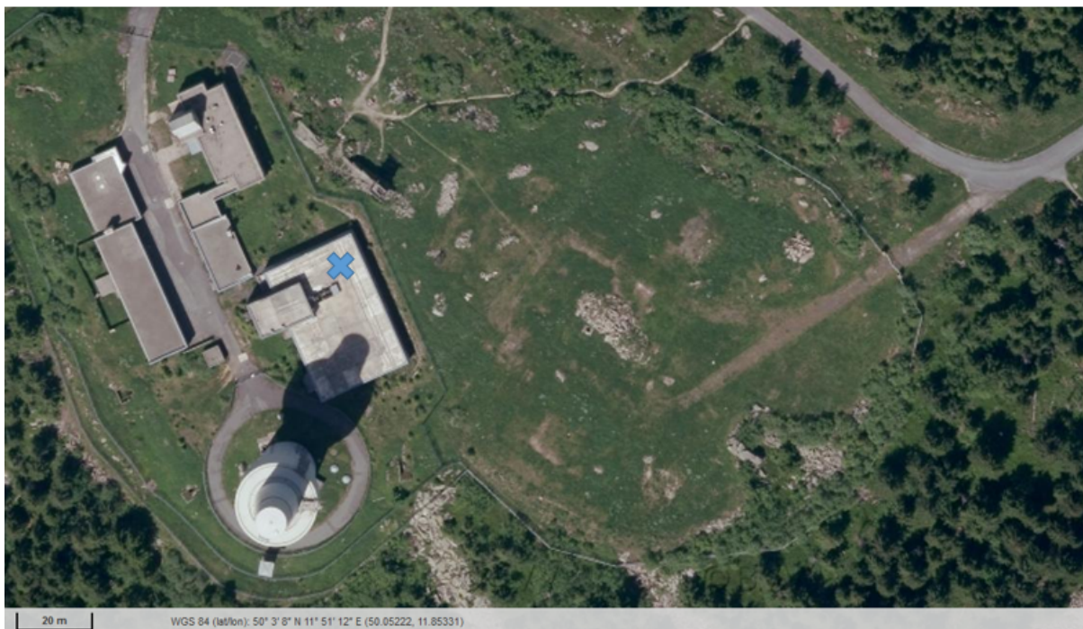
Figure 2.1 Location of Experimental site of Station 1

Station 1 was located on the Schneeberg and more specifically the rooftop of a building next to the tower. Figure 2.1 shows a map of the Schneeberg and the roof on which the instruments were installed, is indicated . The exact description of the instrument is Scintec Flat Array Sodar SFAS with the serial number A-F-0033.