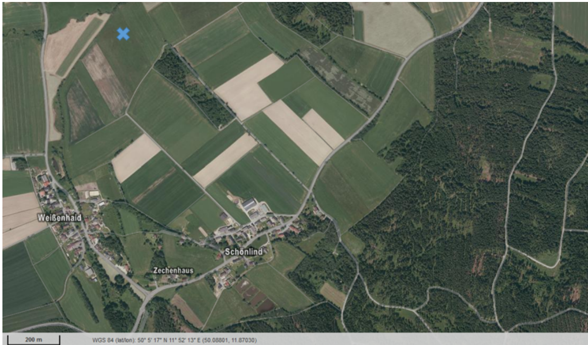
Figure 3.1 Location of Experimental site Station 2

Station 2 was located on a field near Voitsumra. Figure 3.1 shows the surrounding of the site. The exact position where the instruments were installed, is indicated. The site lies 585 m above sea level. The exact description of the instrument is Doppler-SODAR DSDPA.90/64 with 1290 MHz RASS-Extension, both from Meteorologische Messtechnik GmbH (Metek).