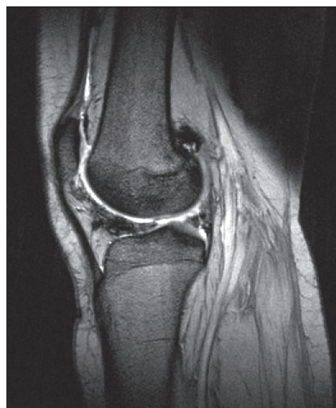
Figure 1. Gradient-echo-based MRI image from a patient with recurrent t-GCT (right knee). There was very low signal intensity corresponding to hemosiderin depositions anterior to the lateral meniscus, extending to the infrapatellar fat pad. Furthermore, there was a hemosiderin deposition in the recessus lateralis posterior to the lateral femoral condyle. These localizations corresponded to recurrent Dt-GCT, which was confirmed by surgical removal.

CIS20r was obtained for 9 of the patients, on average 4.6 (0.2–11) years after arthroplasty. Compared to healthy individuals (Vercoulen et al. 1999), 2 patients scored high ( > 1 SD above the means for healthy individuals) in all 4 domains, i.e. Fatigue, Concentration, Motivation, and Physical activity, and 1 patient scored high on the Motivation and Physical domains (Table 4, see Supplementary data).