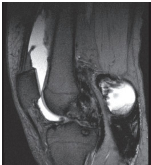
Figure 2. Gradient-echo-based MRI image from a patient with recurrent t-GCT (left knee). There was very low signal intensity corresponding to hemosiderin depositions, particularly in the posterior compartment of the joint and in the popliteal fossa. There was also osseous destruction.

We had 2 cases of aseptic loosening 5 and 6 years after