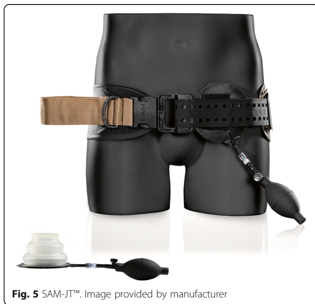
Fig. 5 SAM-JT™.