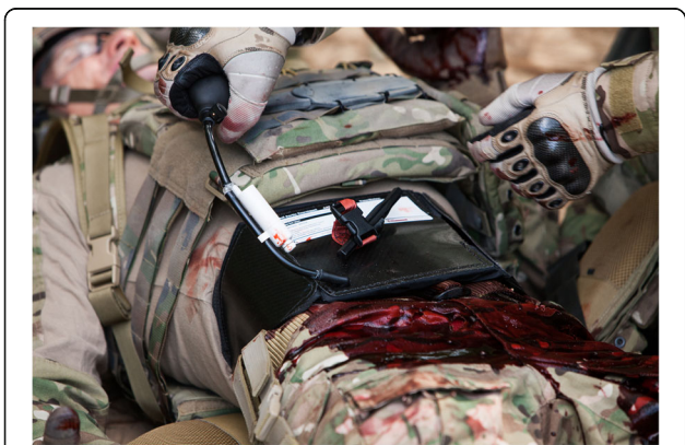
Fig. 3 AAJT™.

Kragh et al. compared the four junctional tourniquets in a simulated out-of-hospital situation by army medics. Unfortunately, at the time of the study, the AAJT™ was only FDA-cleared for truncal application. U.S. armed forces medics preferred the CRoC™ and SAM-JT™ over the JETT™ and (truncal) AAJT™ if they could bring one device on a mission, after testing the various designs at each other [43]. Kotwal et al. reported feedback from battlefield use. The AAJT™ was reported “to be easily broken” and the CRoC™ as “bulky, heavy and takes too