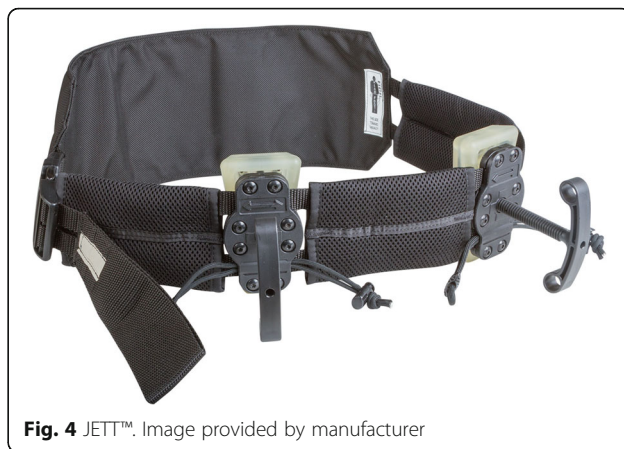
Fig. 4 JETT™.

The Abdominal Aortic and Junctional Tourniquet™, formerly known as Abdominal Aortic Tourniquet™, can be used in several ways. We previously mentioned the use of the AAJT™ in axillary bleeding. The AAJT™ can also be placed over the groin and has a truncal application compressing the distal aorta in the infra-renal zone at the umbilical region. In this way, bilaterally arterial blood