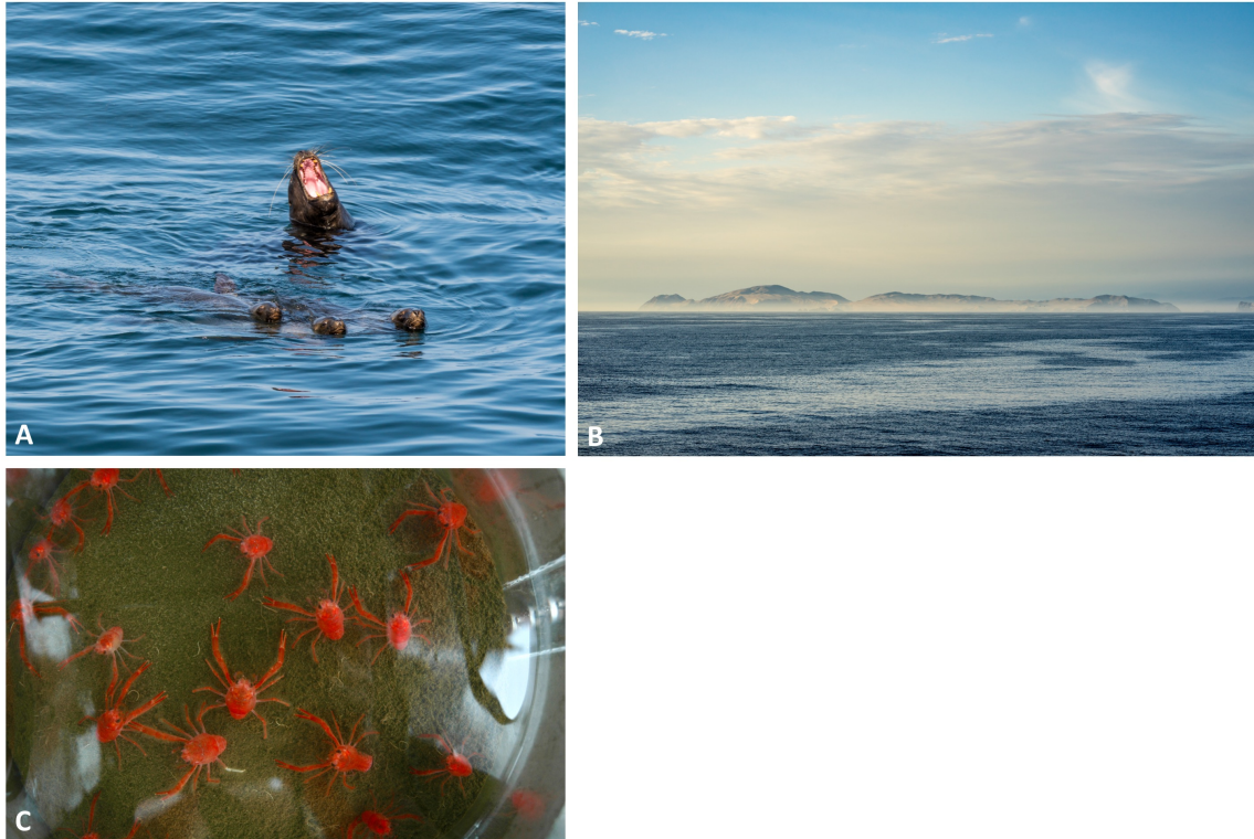
Abb. 3: A,B Curious visitors during our stationwork at the islands Isla San Lorenzo and Isla Callao offshore Callao, (Photos: C. Rohleder). C, P. monodon enclosed in the benthic chamber of the BIGO Lander (Photo: S. Sommer).

At night we continue an intense water sampling programme including water column geochemistry and physics including a trace metal programme using a special CTD water sampler rosette. These measurements are supplemented by the deployment of in situ pumps for radiotracer measurements and investigations to better understand the sulphur cycling in the water column.