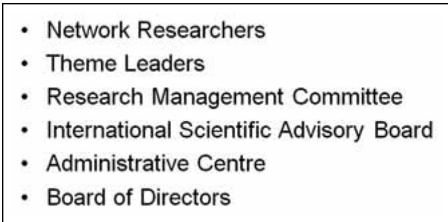
Figure 10. Network governance.

I chair the research-management committee, which looks after the day to day operations (Fig. 10) and I report to a board of directors, comprising a variety of people including venture capitalists. An international scientific advisory board has been wonderful in providing insight into topical areas, including identification and authentication.