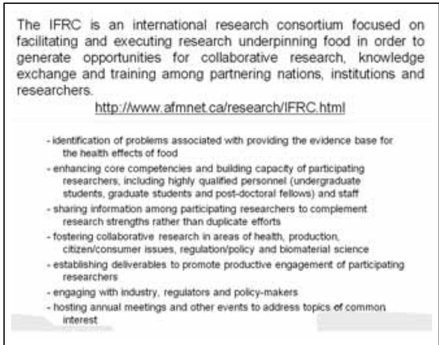
Figure 11. International Food Research Collaboration—objectives.

We are working also with the Canadian Medical Association and have an insert in their magazine, Health . The mother of one of our scientists saw this magazine in her family doctor’s office and reported, “Oh, I read about your research”; Health had replaced a 5-year-old National Geographic magazine in the waiting room. However, this was a tough nut to crack. The concept of using food as a preventative measure rather than as disease-treatment mechanism was something that the Canadian Medical Association apparently viewed as a challenge to future employment.