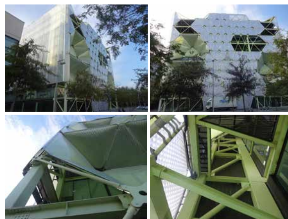
► Fig. 4: Barcelona Growth Centre in Barcelona (Spain), previously named MediaTIC. Case study in Post-Occupational Behaviour Research in Adaptive Facades.