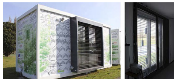
► Fig. 1: P4 Prototype. Sunspace with vertical solar heat storage. Images of University Campus in Pamplona (Spain).