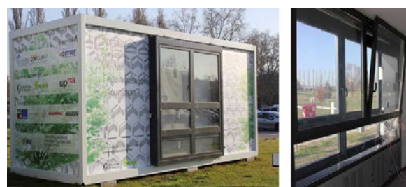
► Fig. 2: P1 Prototype. Sunspace with horizontal solar heat storage. Images of University Campus in Pamplona (Spain).