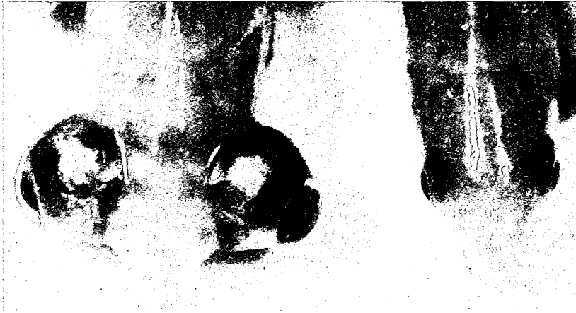
Figure 1. Telescopic-eyed goldfish ( Carassius macrophthalmus ) with genetic constitutional exophthalmos and a common goldfish ( Carassius auratus )