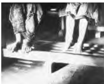
Luis Buñuel, Las Hurdes: Tierra sin pan (1933), pies de los niños.