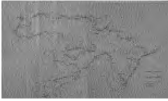
"Exposición de Barcelona 1929. Pueblo Español," Fons Lluís Plandiura, Arxiu Històric de la Ciutat, Barcelona.

that his studio-mate Jacques-André Boiffard published to accompany Bataille's 1929 article on "The Big Toe." In that article, Bataille wrote of the exposed foot and the taboos associated with its appearance in different cultural contexts, including Spanish folklore. That an image associated with transgression should be included within a scene of education is significant. It signals that for Buñuel and his crew, there could be no natural or assumed link between becoming literate and cooperating with prescribed ideals about nationality. The image of the children's feet comes just before a scene in which a boy writes "Respectad los bienes ajenos..." on the blackboard. This, in turn, is followed by a scene of two boys who are struck by the inscription, their mouths open. The pause between seeing the phrase on the blackboard and recording it on paper is drawn out. The process is not automatic, and a space is opened up in the film's syntax for dissidence. Unlike the optimistic (and activist) portrayal of education in the Misiones's photograph, here the relationship between viewer and subject is less clear. Tierra sin pan disrupts the relationship between mapping and literacy by calling attention to the process of learning itself, which is riddled with moments of disjuncture, misunderstanding, and miscommunication.