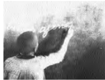
Luis Buñuel, Las Hurdes: Tierra sin pan (1933), niño escribiendo en la pizarra.