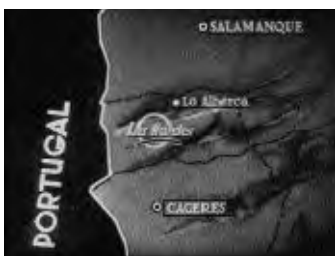
Luis Buñuel, Las Hurdes: Tierra sin pan (1933), mapa.