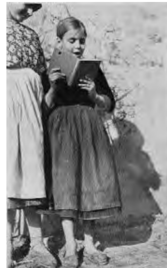
“Una lectora en Carrascosa de la Sierra (Cuenca),” Patronato de Misiones Pedagógicas. Septiembre de 1931 - Diciembre de 1933 (Madrid, 1934).

Another form of cultural orientation takes place as well. Our own act of reading (of literally holding the Informes between our hands to see her) mirrors her act of reading. Viewer and subject create together a literate community, where reading becomes the foundation for assumptions about shared values. The power of the printed page and of education to forge what Benedict Anderson has termed “imagined communities” is critical to understanding how photography formed a bridge between urban and rural inhabitants in early 20th-century Spain 3 . Anderson argues that print-languages “laid the basis for national consciousness” by unifying fields of exchange and communication and by creating “languages-of-power” 4 . It was through the institutions of the census, maps, and museums that Anderson sees the articulation of community in the context of colonialism and post-colonialism. While Spain has its own historical conditions (and issues of colonialism and post-colonialism), I want to use Anderson's idea of print culture to think about the relationship between mass media and the discourse around rural Spain and documentary that informed debates on the nation, modernity, and representation during the 1920s and 1930s. It is during this period that there is a heightened attention to the forms and the figures of nationality. Photography plays a key role, but it does so by