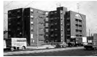
Robert Venturi in association with Cope and Lippincot, Guild House, Philadelphia, 190-1963; view from Spring garden Street.

Like Kahn, and many other architects, the Venturis had made proposals for the 1976 Philadelphia Bicentennial Exposition which were at first no more successful. Yet predictably, and unlike Kahn, Venturi, Rauch & Scott Brown