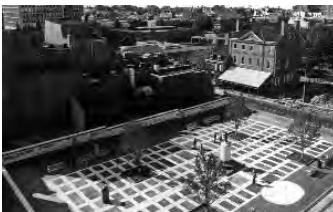
Venturi, Rauch and Scott Brown, Welcom Park, Philadelphia.

always visualized the event as a fair; the great "thing", in their eyes, that deserved to be celebrated was "people-to-people communications". Since theirs, in short, was a vision of modernity inspired more by the views of Marshall McLuhan than by "modern architecture", their official project involved colossal signs and electronic message boards for information and entertainment.