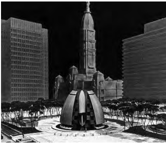
Venturi and Rauch. Fairmont Park Fountain Project (1964). Photomontage showing the proposed fountain at the foot of City Hall, with Penn Center Office towers right and left.