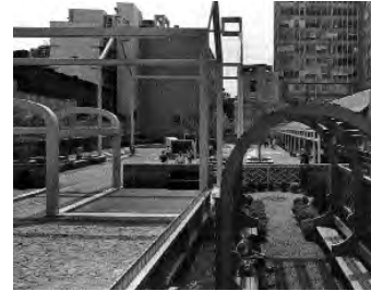
Venturi and Rauch, Franklin Court, Philadelphia, 1972-1976.