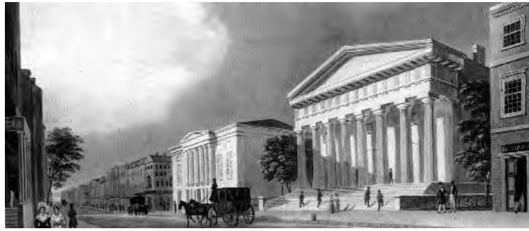
William Strickland, view of Chestnut Street with the Second Bank of the United States on the right, Philadelphia, watercolor, early nineteenth century.

itself, arch-icon of the Red (brick) City of the revolutionary era, built 1732 to 1756 and visible from a distance thanks only to its awkwardly proportioned steeple, "widely out of scale on the garden side and in any distant view but falling into perspective from the street" 3 . Next to Independence Hall, Independence National Historic Park begins, with William Strickland's Second Bank of the United States of 1817-24 (one of the nation's first public buildings in the Greek Revival style) as well as, further to the east, the Philadelphia Exchange of 1834, again by Strickland.