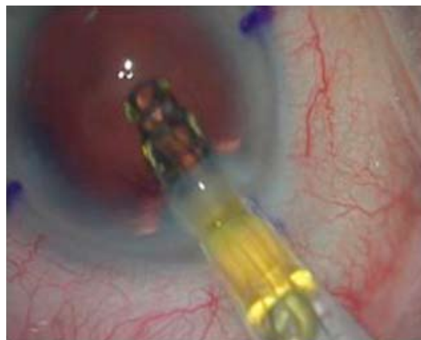
Figure 1 – Lens injection with Monarch II cassette.

Fort Worth, TX, USA) to determine the cylinder power (IOL model) and the exact pre-surgery IOL. The three lens models implanted were SN60T3, SN60T4 and SN60T5 for IOL plane cylinder correction of -1.50 , -2.25 and -3.00 D, equivalent to -1.03 , -1.55 and -2.06 D in corneal plane, respectively. Following the software IOL selection algorithm, the adequate IOL was determined for each patient and requested from the manufacturer. In the immediate presurgery, minutes before the intervention, the 0^\circ - 180^\circ axis was marked with the patient at 90^\circ from the floor to avoid torsion phenomena and, with the surgical fields in place, we marked the axis for the IOL calculated by the software using the 0^\circ - 180^\circ axis as reference. All the surgical procedures, carried out by the same surgeon (JMM) with the Phaco-Chop technique went smoothly. The IOL implant was performed in the conventional manner with the Monarch II injector through a 2.4mm incision (fig. 1) and the IOL was centred placing its axis as calculated by the software. The irrigation-aspiration was performed softly to avoid lens rotation. The post-op was conventional, with topical administration of prednisolone-neomycin-polymixin B (Poly-pred ® , Allergan Inc., Irvine, CA, USA) in descending pattern, without events in any of the 54 eyes. Two months after the intervention the NCVA and BCVA were determined, together with the post-op residual astigmatism and the final