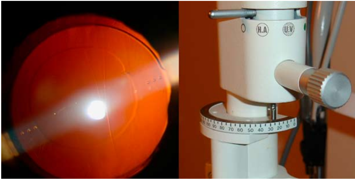
Figure 2 – Annotation of the post surgery lens axis, showing the points at both sides of the lens indicating its axis. Detail of slit lamp to measure final axis (25 degrees).

IOL axis after midriasis (fig. 2) with phenylephrine eyedrops 10% - tropicamide 1% (Alcon Cusí, El Masnou, Barcelona, Spain). The data were analysed with the SPSS 15.0 software (SPSS Inc, Chicago, IL, USA).