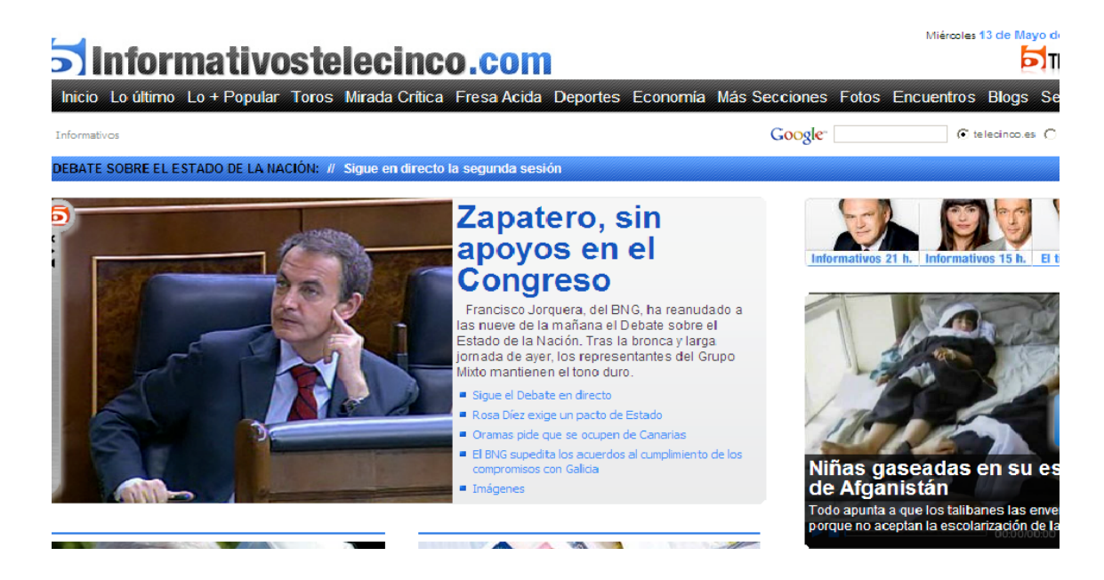
Illustration 1. A screenshot of the Informativostelecinco.com website