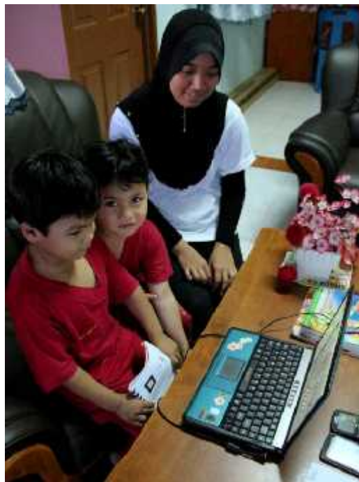
Fig 2. Data Collection Process

The application is tested on 10 Malay pre-school children aged between 3 to 6 years from several kindergartens in Changlun and Sintok as shown in Fig. 2. The results of the pronunciation test are shown in Table 1. The average lowest accuracy is the average accuracy of the first trial of each speaker pronunciation the given words.