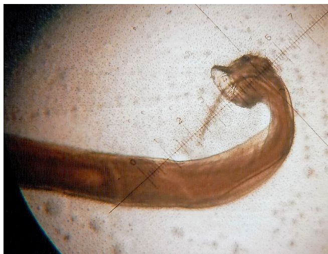
Fig. 2. The tail end of a male Angiostrongylus vasorum identified from golden jackal

In this study, 2 male (Fig. 2) and 6 female specimens (Fig. 3) of Angiostrongylus vasorum were recovered from the left ventricle of the heart and the pulmonary artery of a juvenile female and an adult male golden jackal.