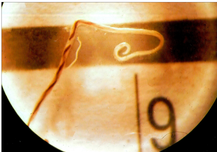
Fig. 3. A female Angiostrongylus vasorum identified from golden jackal

The results of Knott's test for detecting microfilariae in the blood were negative.