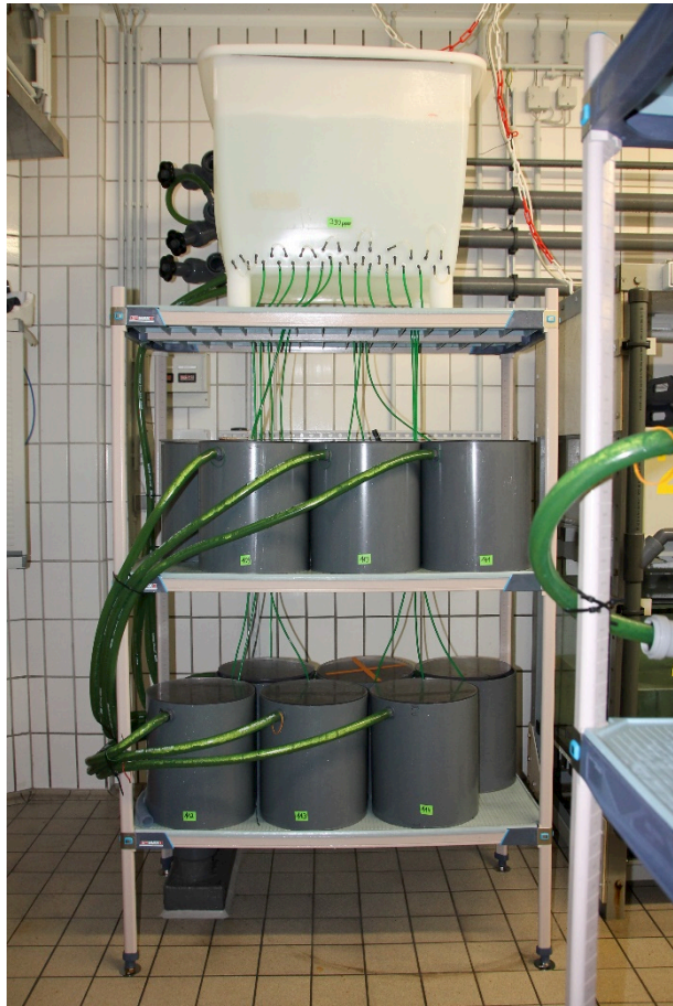
Figure S1: Representative incubation system of one treatment group with 12 animals. Each grey tank contains a single individual. Water supply is given from one header tank (white container on top) for each treatment group, in which water is pre-gassed in accordance to the respective CO 2 treatment (Photograph courtesy of Kristina Kunz).