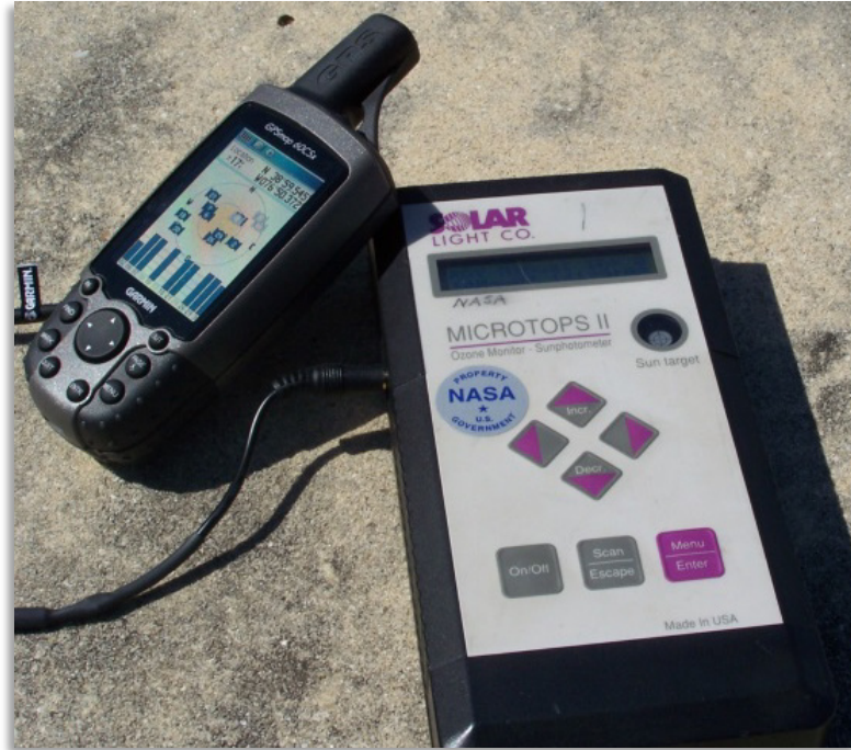
Fig. 3.1: Calibrated Microtops and GPS unit provided by NASA's Marine Aerosol Network