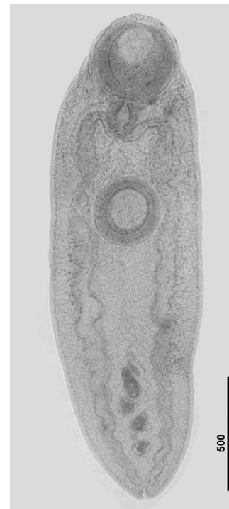
Figure 2. Metacercariae of Brachylaima sp. from the body cavity of Phyllocaulis variegatus (ventral view). Measurements are given in micrometers ( \mu\text{m} ).