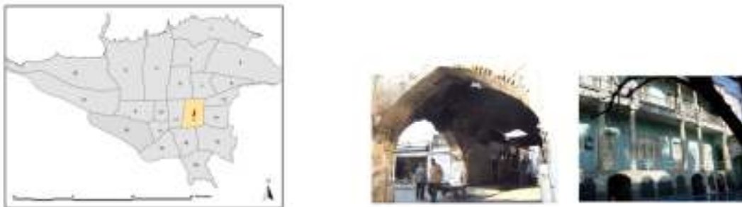
Fig1. (a) Oudlaajaan's location in city of Tehran, (b) Some valuable space of Oudlaajaan's

2.1 Historical neighborhood of Oudlaajaan and its situation in today's Tehran contexts Oudlaajaan, a neighborhood in the west of Tehran, was built during Safavid Dynasty and is now, due to wrong policies applied by urban management authorities during different eras, worn in many aspects. With the inhabitants not feeling to belong in the place and the presence of functions which do not match the physical body, the area has completely lost its visual values. On the other hand, in spite of all the existing disharmony and disorganization, Oudlaajaan neighborhood is a well-established settlement where people have been born, lived and died for generations and have communicated with its physical and environmental elements. Hence, it seems apt to focus on some aspects of the landscape features of the context in the urban design process.