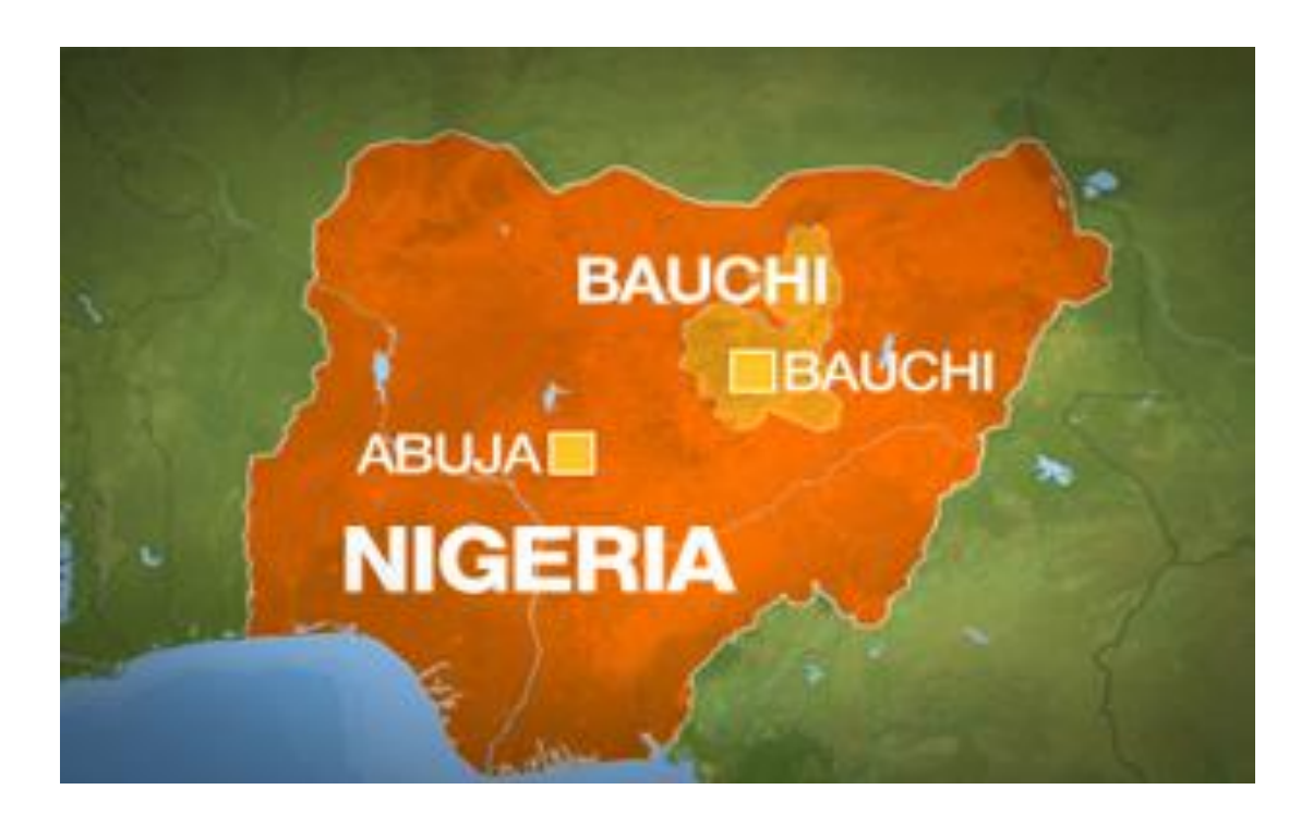
Plate 1.1: Map of Nigeria showing Bauchi State (adopted from Bauchi State/ Safer Nigeria Resources, 2012)

BAGIS, 2012), while the metropolis covers a total land area of 3,687 square kilometres (Ogwuche, 2013).