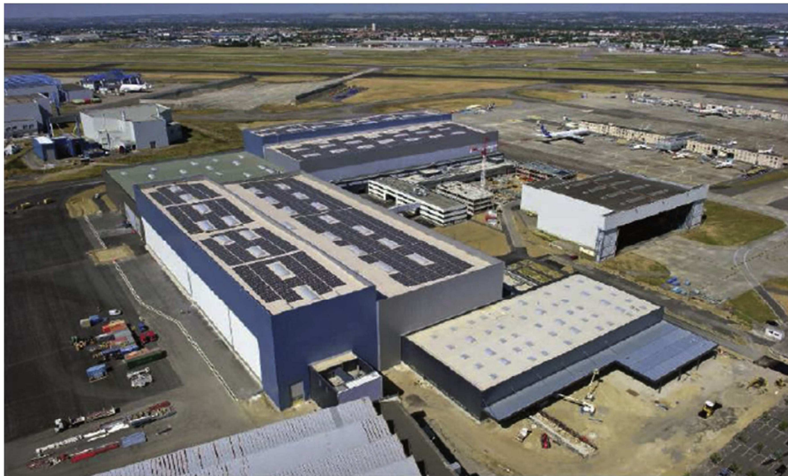
Fig 2. Aerial view of Final Assembly Line (FAL) of the new Airbus A350.

1. REX with positive event (case of risks related to the insulation, sealing and production system building energy) (Tables 4 and 5).