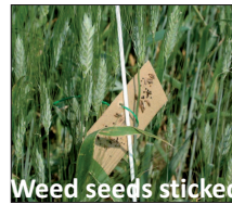
Weed seeds stuck