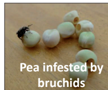
Pea infested by bruchids