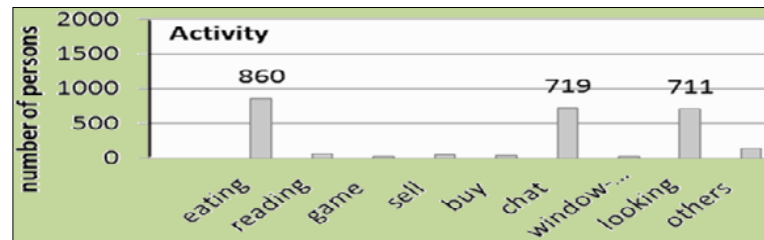
Figure 5: Various stationary activities in Meldrum Walk

In brief, the results show that eating/drinking, talking and watching other people are the most observed (89%) activities in Meldrum Walk. Sitting is the popular posture (78%), followed by in compare to standing and lying (Figure 5). There is a high degree of socializing in Meldrum Walk because people spend more time on leisure and social activities while participating in groups rather being alone.