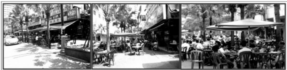
Figure 2: East sidewalk; place for cafes' tables rather than walking.

As cafes' tables and chairs occupied the whole walkway at East sidewalk, two third of walking activities happen at the opposite side, which is less friendly for their walking (Figure 2).