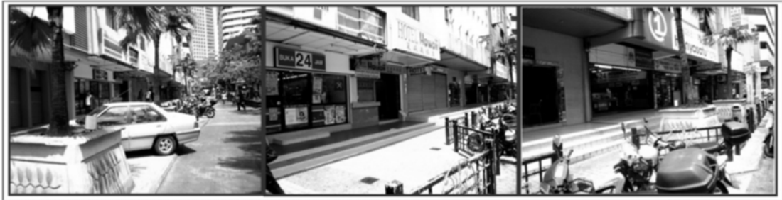
Figure 3: West side of the Meldrum Street.

Comparing (day vs. night) averages of pedestrian density shows that the area is averagely more vibrant during evening time (Table 1).