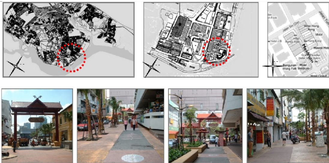
Figure1: Meldrum Walk (map and views)