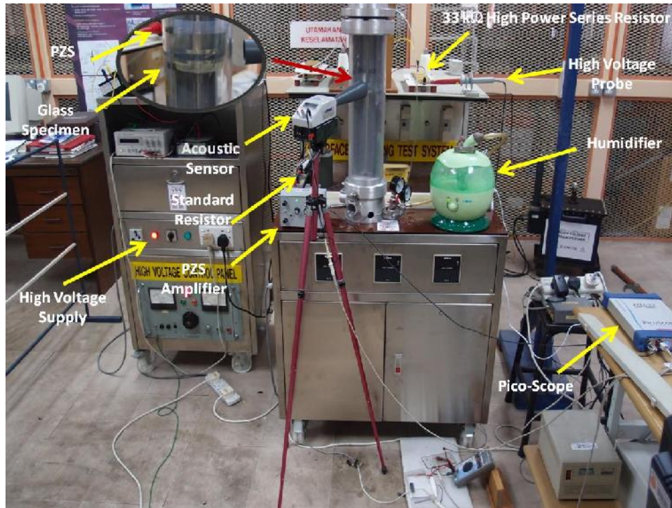
Figure 31 Experimental setup for generating ID

The test setup consists of two main parts: the circuit loop (AC source, transformer, connections and insulator), and the measurement and acquisition system (earthing resistor, wideband antennas). Figure 1 shows the experimental set-up for generating various types of discharges as well as detecting the consequent acoustic signal due to the PDs. The test cell was connected across a high voltage source.