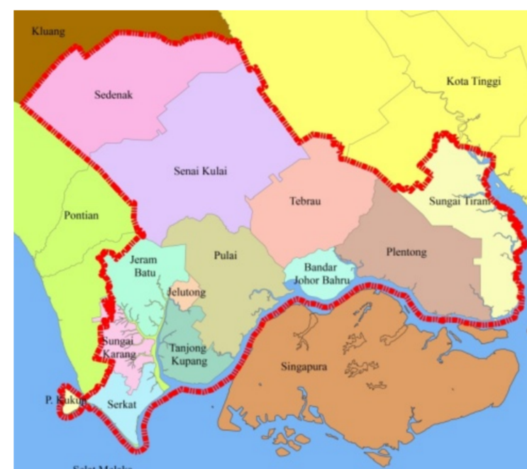
Figure 1: Iskandar Malaysia, Johor, Malaysia

The study area is Iskandar Malaysia, Johor as shown in Figure 1 and there were 394 neighborhoods which the study was able to identify. For the purpose of this study, only a few neighborhoods were chosen representing construction dates of 1980s until 2000s. All the neighborhoods are planned housing areas and other than that such as villages are excluded.