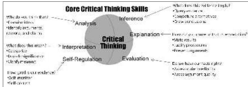
Figure 2: Core Critical Thinking Skills (Youens et al. , 2014)

Referring to Figure 2 which shows the basic elements of critical thinking, there are six elements and two of which are closely related to higher-order thinking skills. According to Youens, thinking critically is vital for the future of the student as they will constantly reflect on their thinking when making a decision which will indirectly strengthen the comprehension of a concept deeply. Students will also be able to evaluate all the decisions that they have made in the past. In fact, according to Faturohman (2012), students who think critically can be deemed responsible as they are used to thinking thoroughly, openly and imaginatively before making a decision. The ability to think critically is vital because in our daily life, all of us, not just students, will face a situation whereby we have to make a thoughtful decision that can determine whether the outcome is favourable or otherwise.