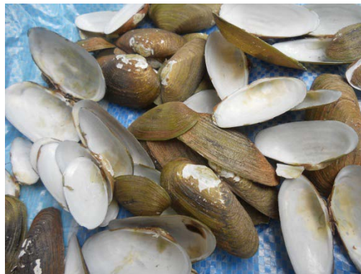
Figure 7.2: Sample of seashell, mussel ( Pernaviridis )

The purpose of this study is to determine the properties of ground seashell in cement mortar cubes, prisms, cylinders, plates and prism bars. All types of tests are conducted to achieve the objective of this study to replace with the seashell in cement mortar. In this study, the overall program is to determine the engineering properties of seashell in cement mortar. Cement mortar specimens are applied to different exposure conditions such as air (indoor), water, natural weather (outdoor) and wet-dry cycle. In this research, the laboratory tests are conducted according to the procedures show in Table 7.1.