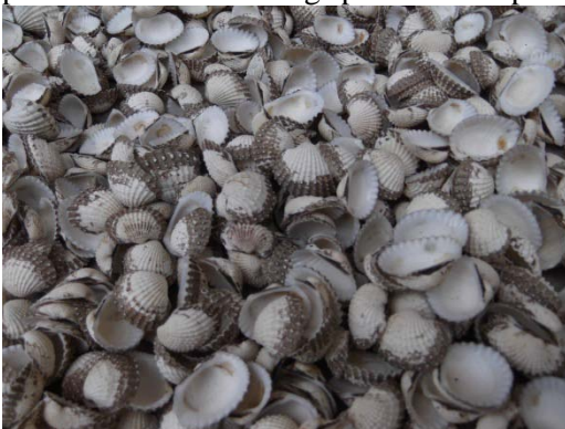
Figure 7.1: Sample of seashell, cockle ( Anadaragranosa )

The materials used in this research study for mixing mortar samples are ordinary Portland cement, sand, seashell and water. The raw materials, seashell used in mortar are mussel ( Pernaviridis ) and cockle ( Anadaragranosa ). The samples of cockle show in Figure 7.1 while the samples of mussel show in Figure 7.2. The performance of mortar is determined by the properties of material. The properties of a selected material must satisfy the criteria selected from the trial mix design before mortar samples are mixed with the raw materials. The production and proportion for mixing mortar sample, the preparation and testing procedure for the testing specimen samples and the standards used for the tests are discussed in detail.