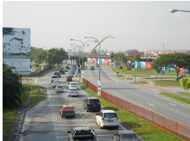
Figure 1 Layout one of the intersections studied (Site B)